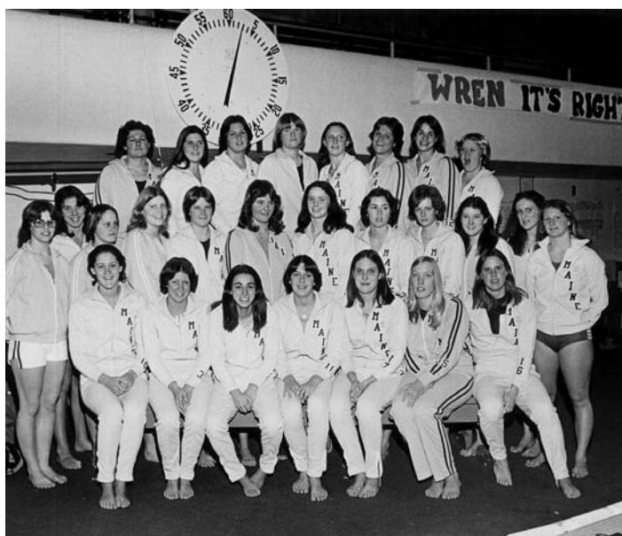
1977-78 — A CHAMPIONSHIP TEAM